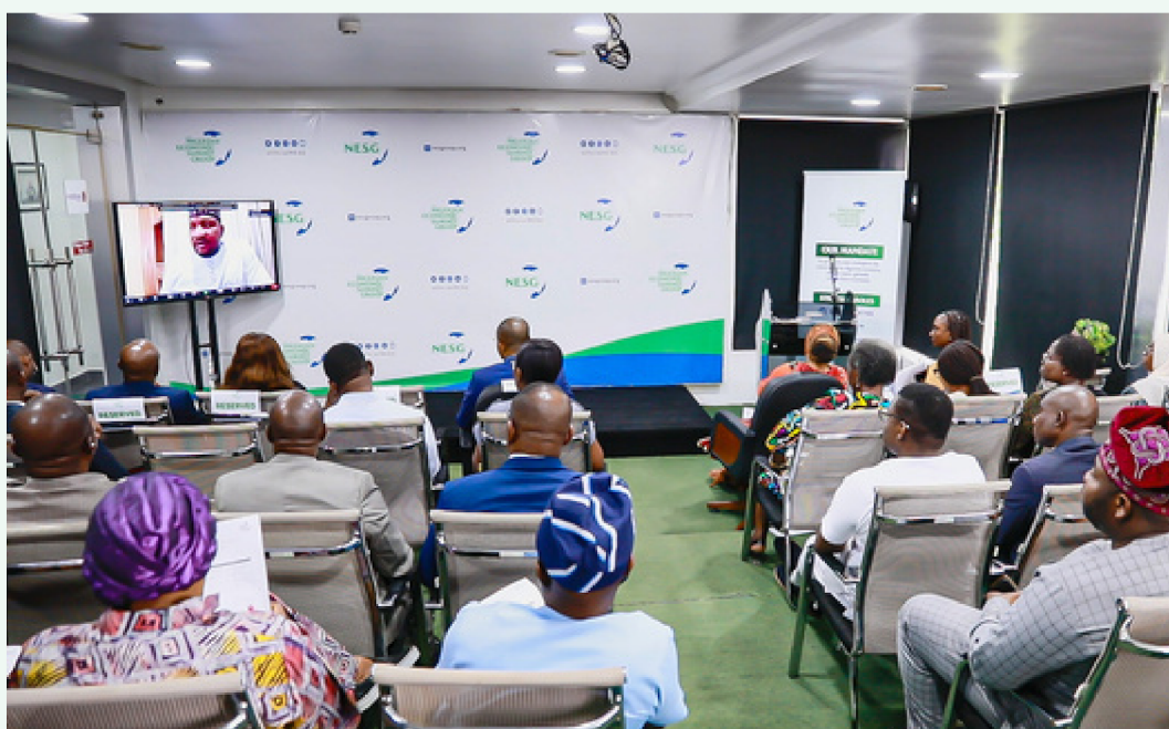
Cross Section of Participants at the General Assembly