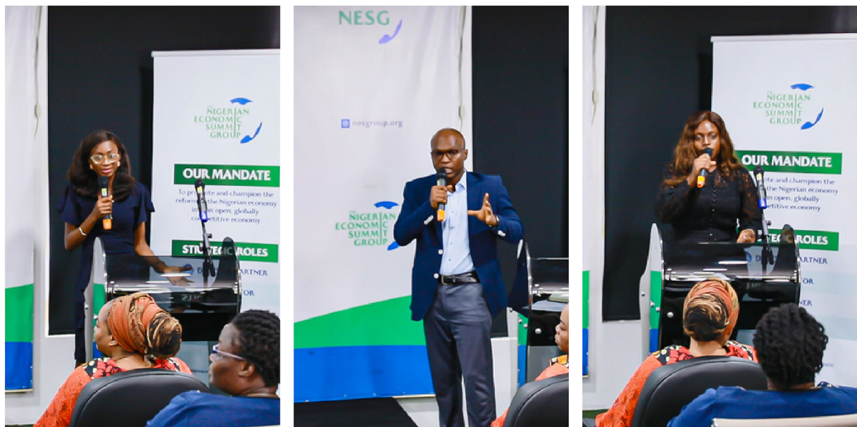
Participants presenting their Proposals at the General Assembly