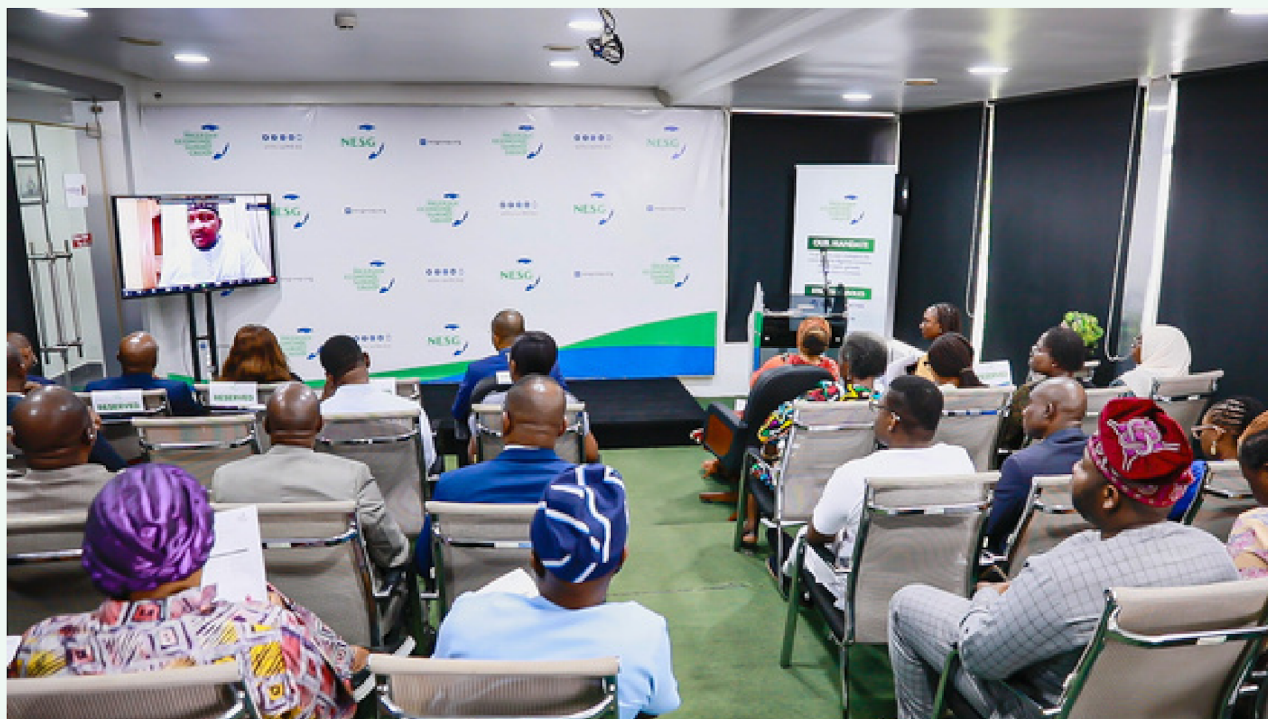
Cross Section of Participants at the HPC General Assembly held at the Summit House on March 31, 2023

The HPC also adopts the various Nigerian Economic Summit recommendations as it relates to fostering equality in access to health, ensuring quality health services and financial risk protection.